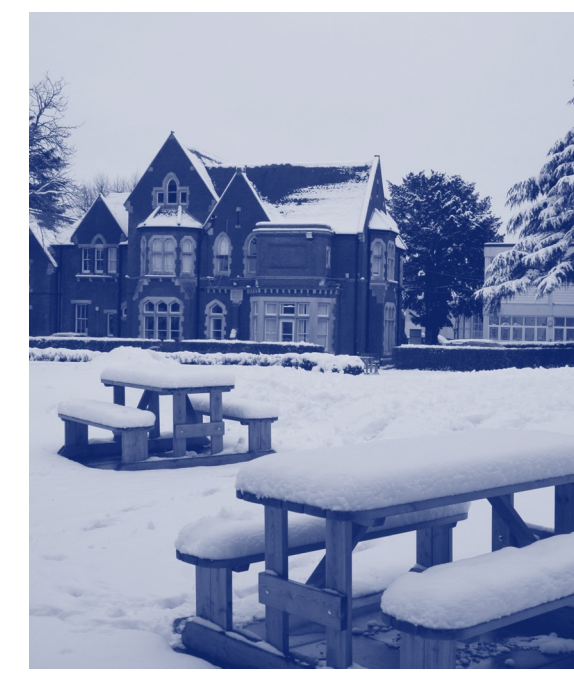
In the event of school closure, students should complete work set in Satchel One (Show My Homework)

Hayes School is committed to ensuring that all our students are able to maximise their potential and any decision to close the school will not be taken lightly. We will aim to remain open or partially open during inclement weather to avoid disruption to students' learning but will consider the conditions and safety of students on the school site, transport links in the area as well as levels of staffing. Hayes School has good public transport links and we rely on parents to make appropriate decisions about student safety when travelling during periods of inclement weather. Students should wear suitable clothing when travelling, including a hat, gloves and a suitable coat, as necessary. Suitable footwear to cope with the weather may be necessary.